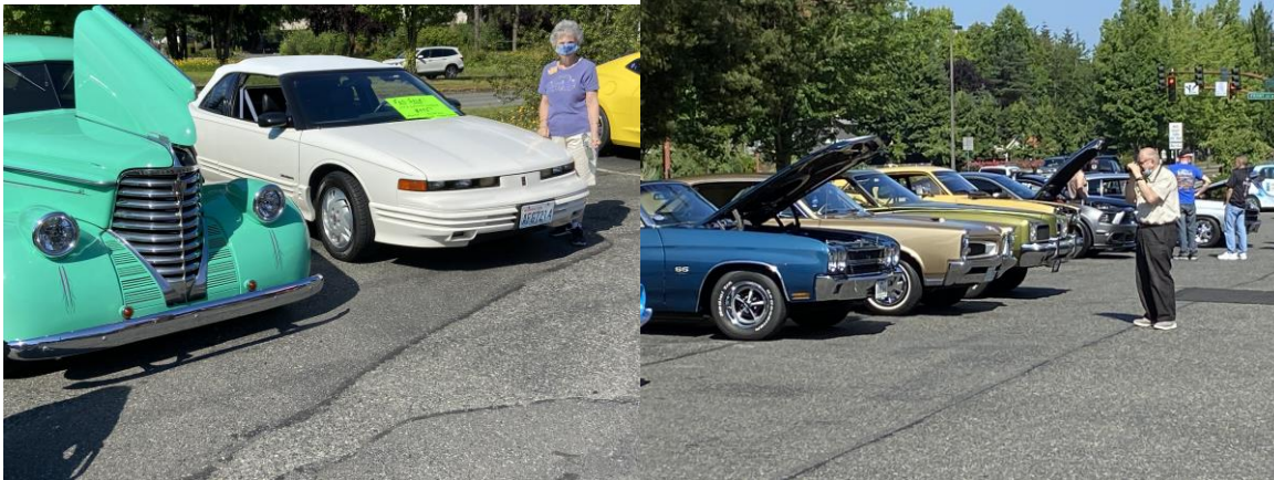
A nice line up of cars at the Fund Raiser. Olds, Chevs and Pontiacs.