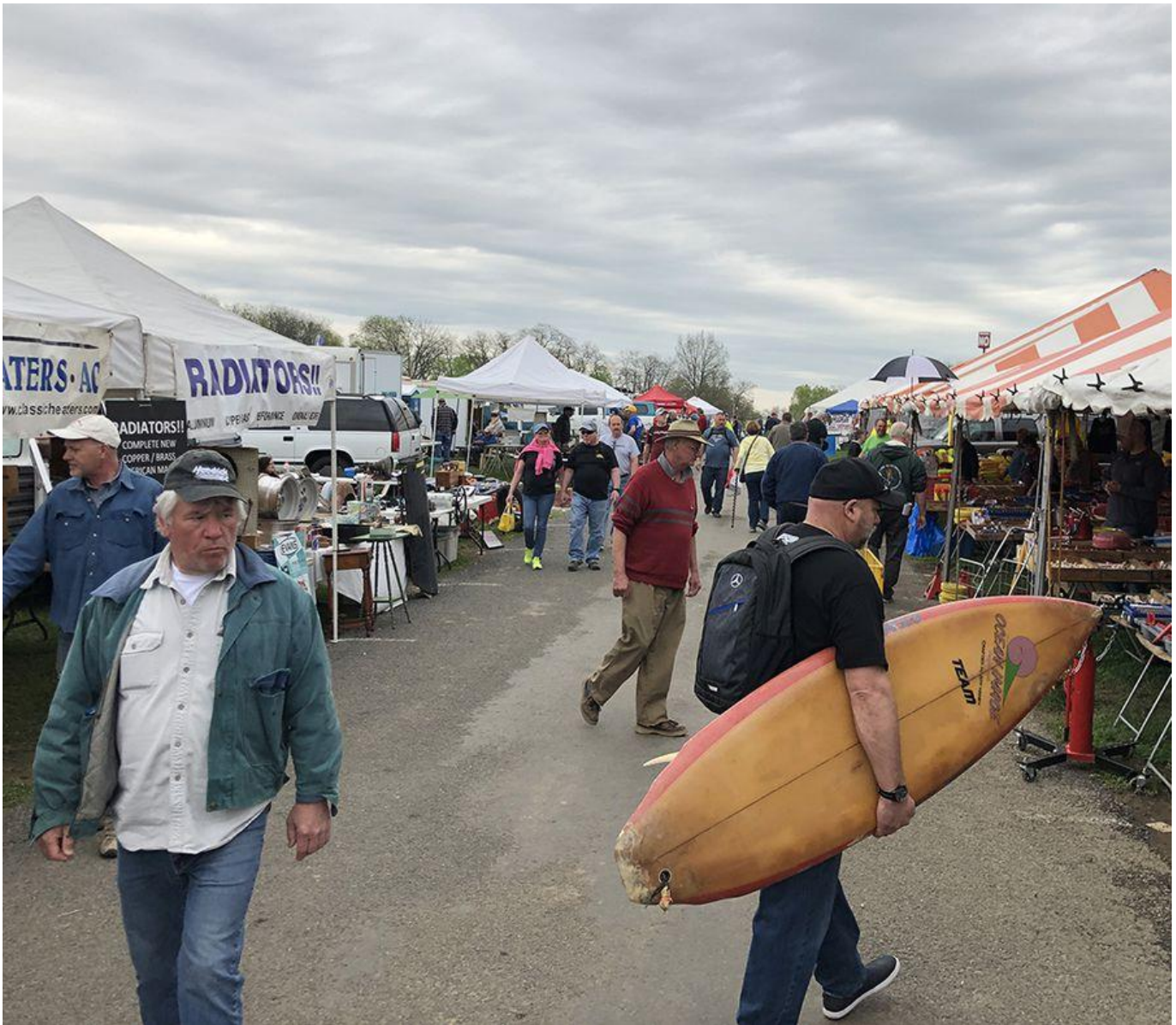
Social distancing at a swap meet...