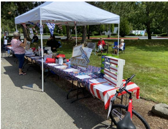
The “Silent Auction” items on display