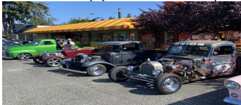
Rat Rods and a custom Chev pickup were the first to arrive.