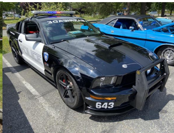
Even a “Tribute” police car attended