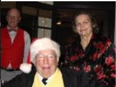
Our chapter was richer for the contributions of these members!