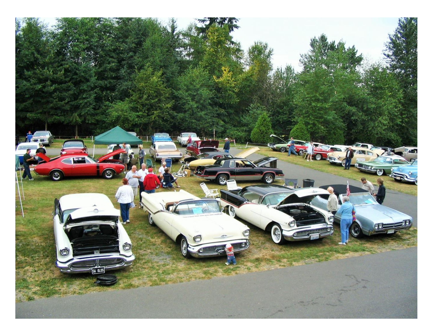
Chapter members...it is time to begin the planning of the 2020 Zone Show in Edmonds.

(Photo above of a Zone Show at the Country Village)