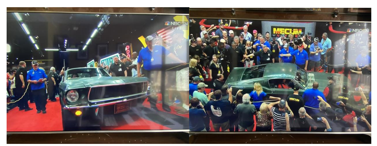
Bullitt Mustang arriving on the auction block