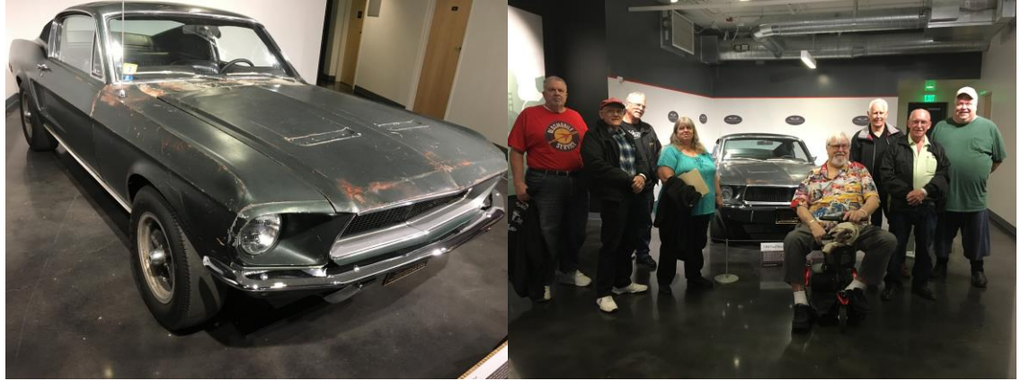
The Bullitt Mustang on display in Tacoma