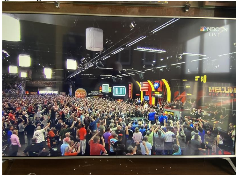
Thousands of cell phones focused on the Bullitt Mustang