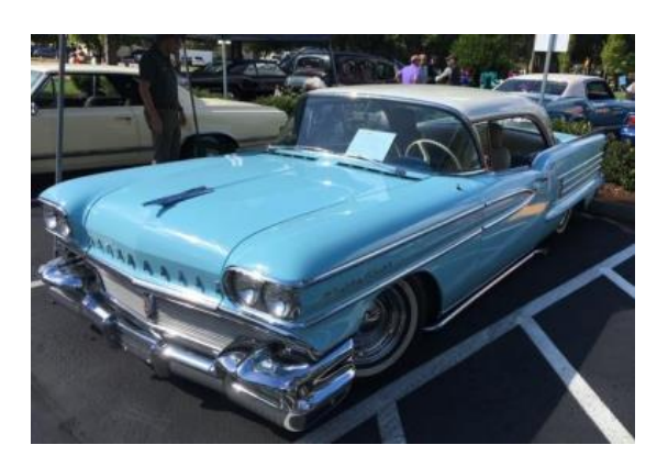
Saturday July 11, 2020 10:00am-2:00pm

Frances Anderson Center 700 Main St Edmonds WA 98029