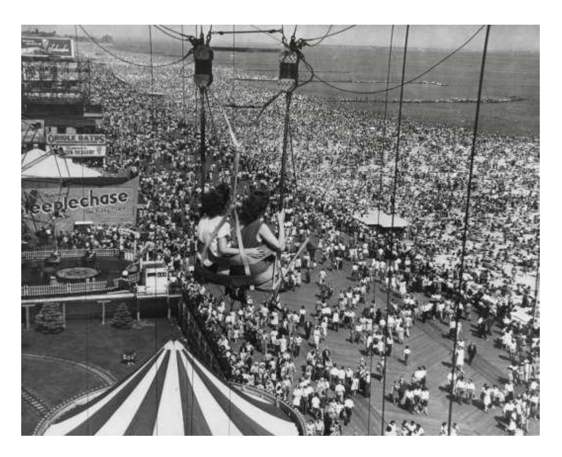
Coney Island – before "Social Distancing"