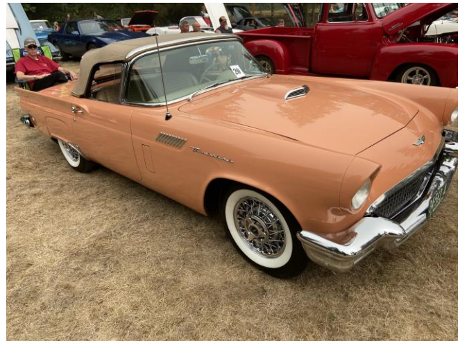
'49 Lincoln '57 Thunderbird