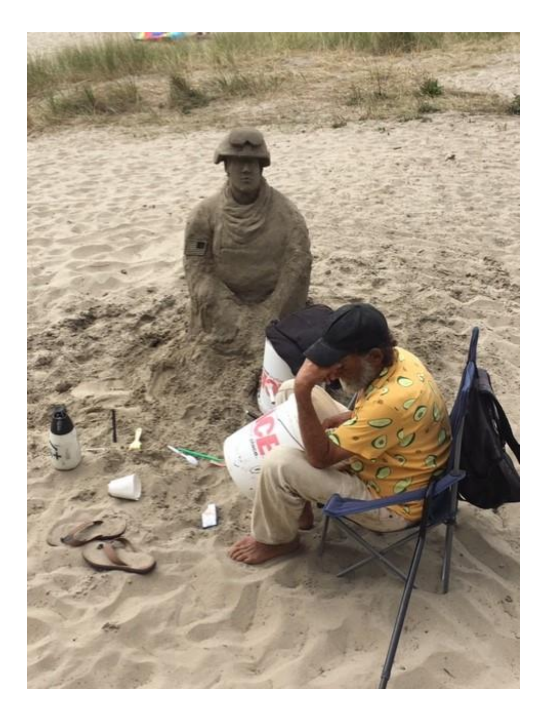
In a recent trip to Seaside, Oregon, we viewed this amazing sand sculpture under construction. What a talent!