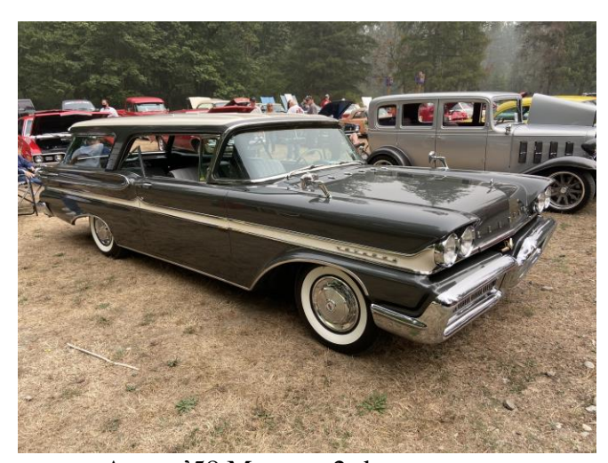
A rare '58 Mercury 2-door wagon