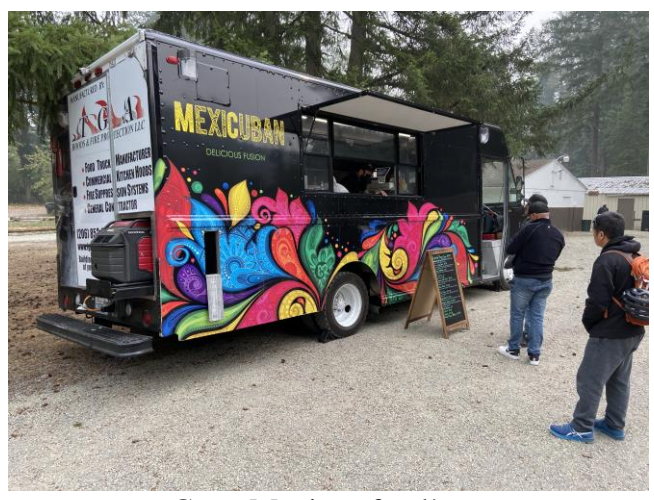
Great Mexican food!