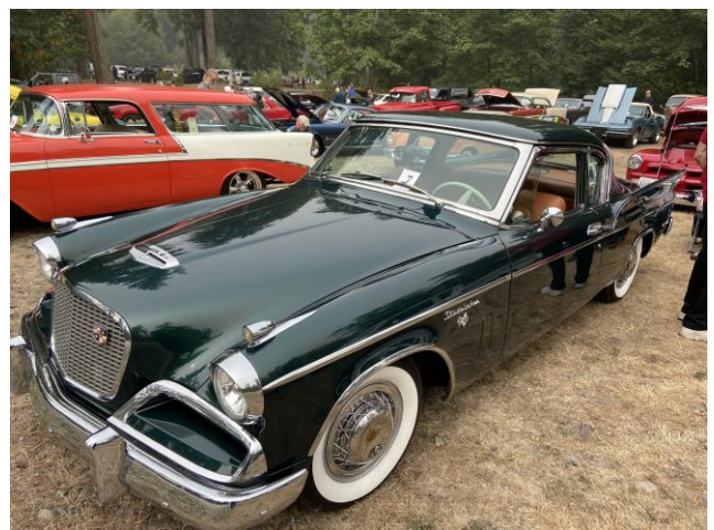
His and Hers '61 Studebaker Silver Hawks