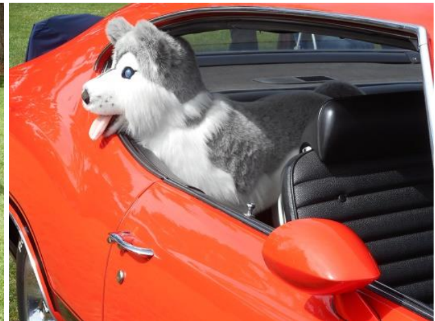
A great day to take your dog to a show