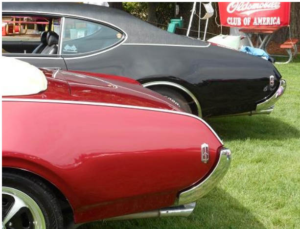
A line up of Cutlass fenders