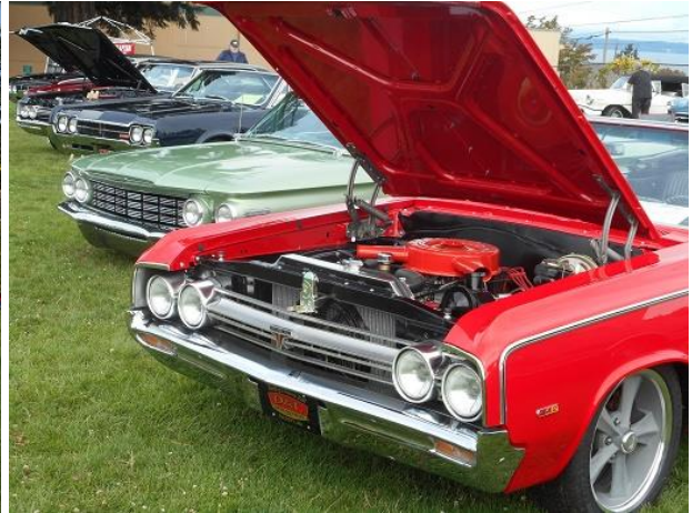
A beautiful convertible