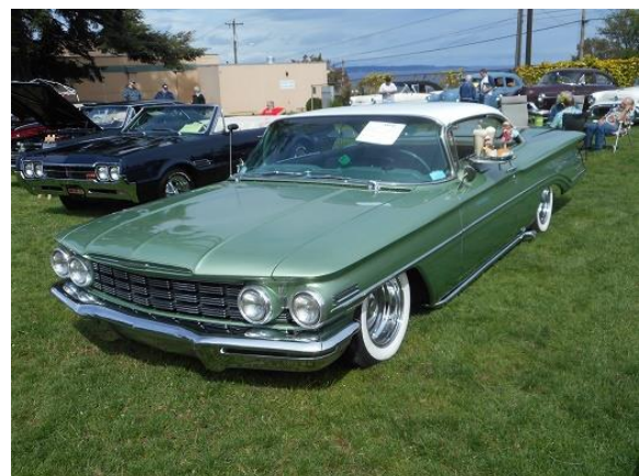
The Fantasy Award winner.