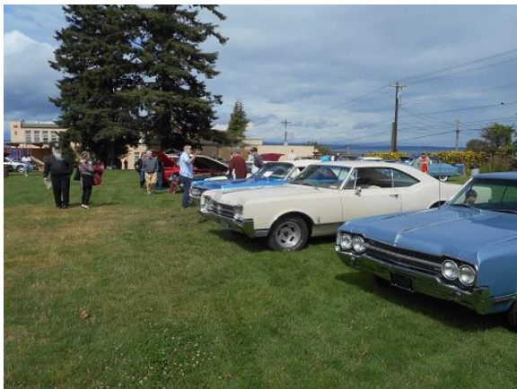
More Olds on the show field