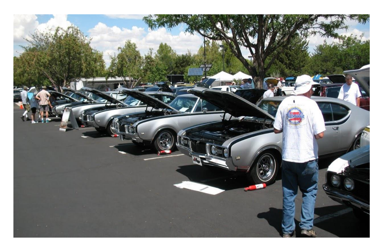
A row of '68 Hurst Olds at the 2017 Nationals