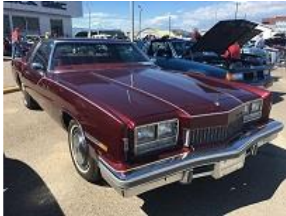
Rocket Round Up