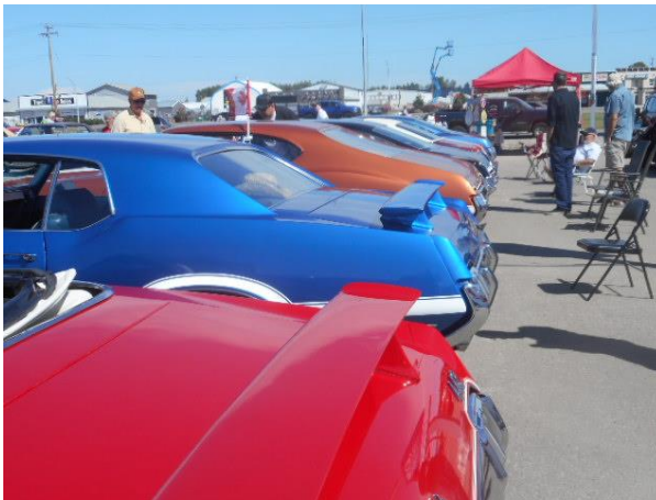
Rocket Round Up