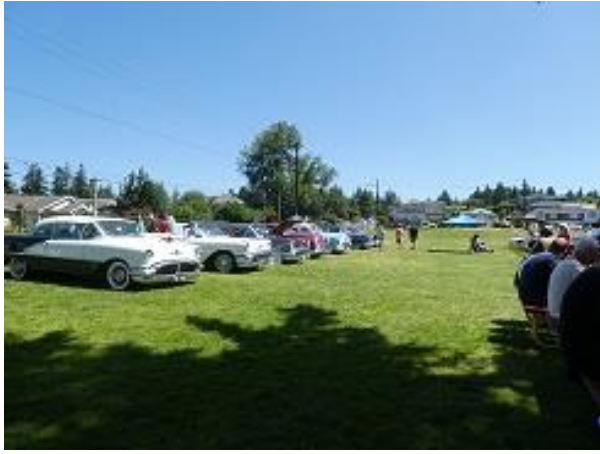
PNW Zone Show