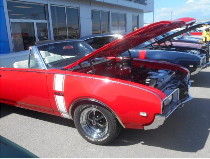
Rocket Round Up