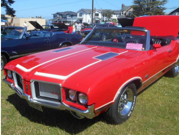
PNW Zone Show – Favorite '70s