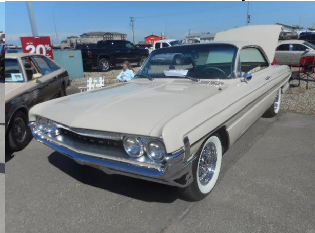
Rocket Round Up