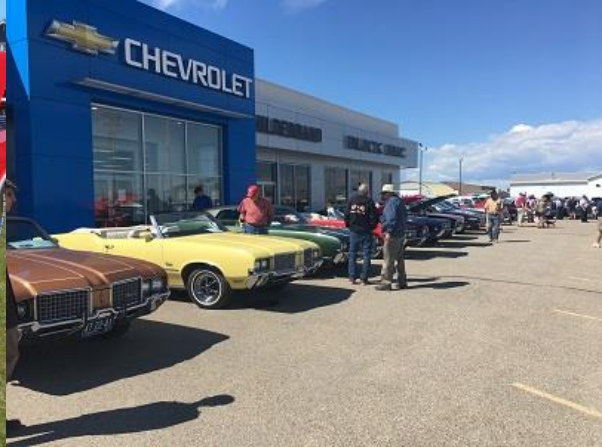
Site of the 2018 Rocket Round-Up