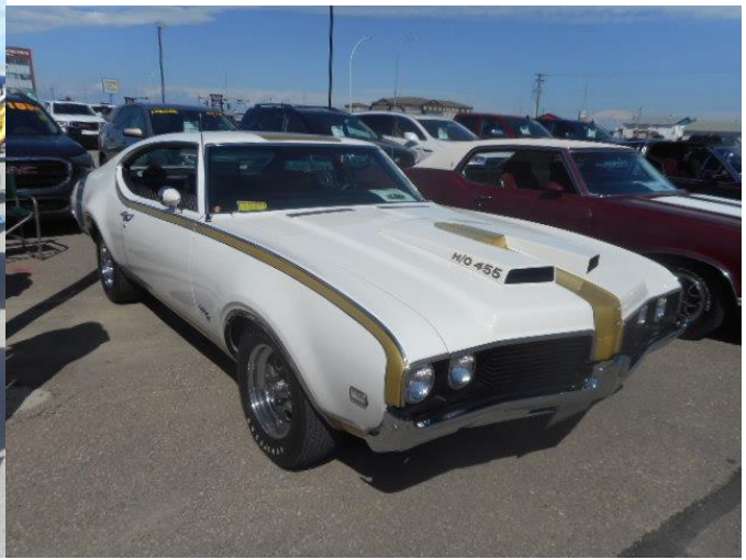
Rocket Round Up