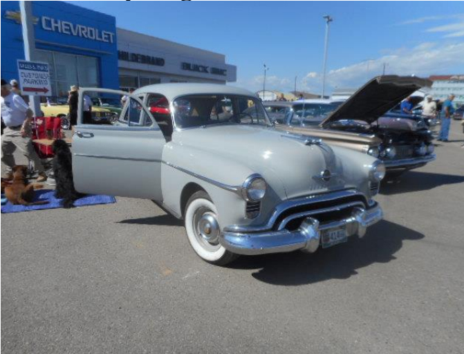
Rocket Round Up 442's in a row