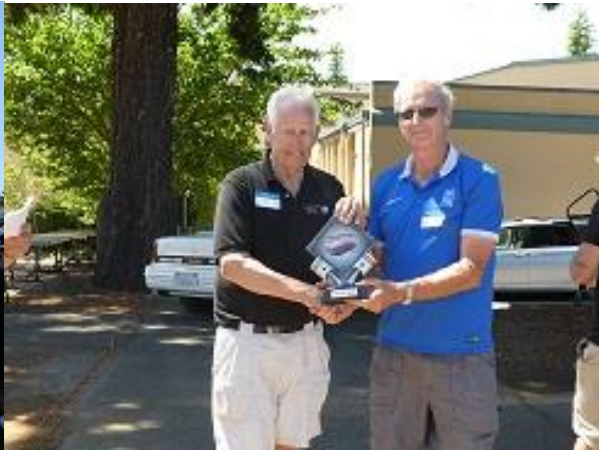
PNW Zone Show