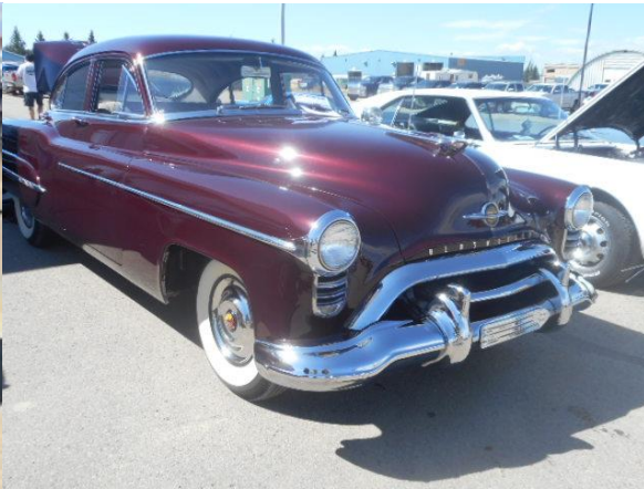
Rocket Round Up – Mayor's Pick