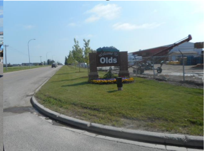
On the way to the show One fine "Bubble-Top"