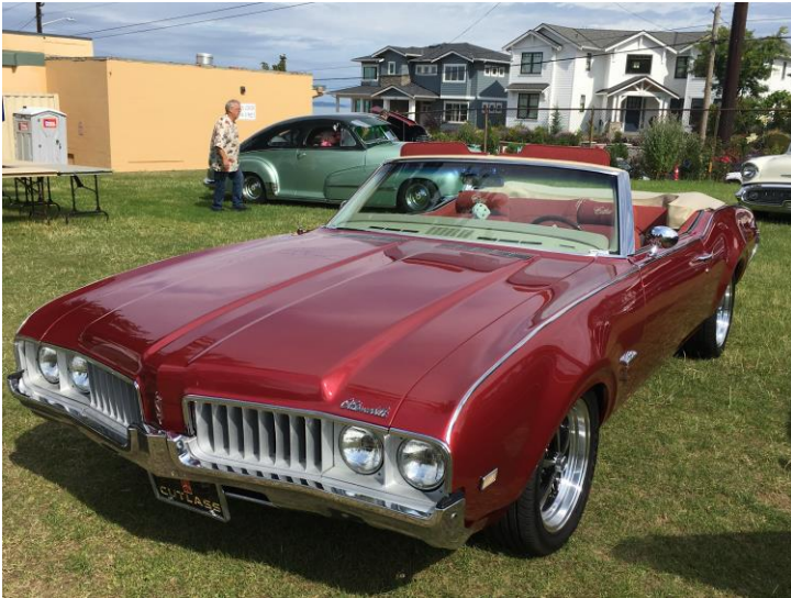
Jim Edwards – '69 Cutlass S – Best Interior