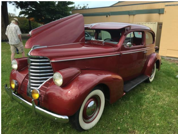
Jim Grigg's '38 Touring Sedan