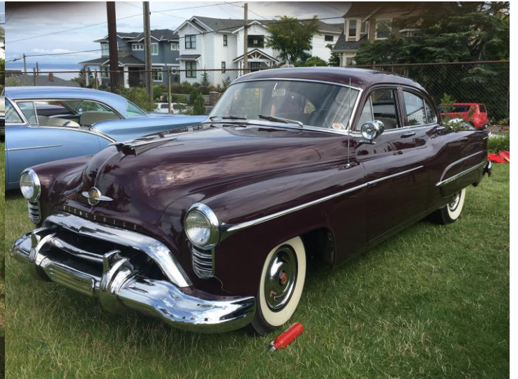
Editor's '50 98 Town Sedan