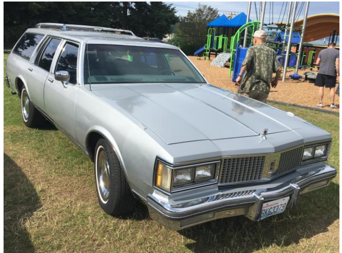
Hugh Russell – 1987 Station Wagon