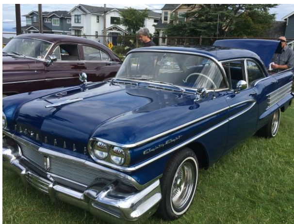
Beau Stone's '58 Holiday 88