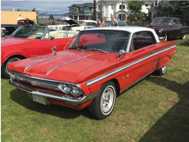
Caleb Wright – 1962 F85 Jet Fire