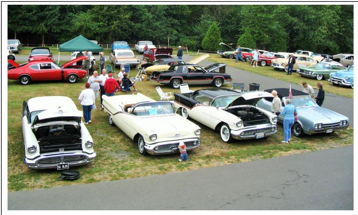
Photo above from the 2009 Pacific Northwest Zone Show