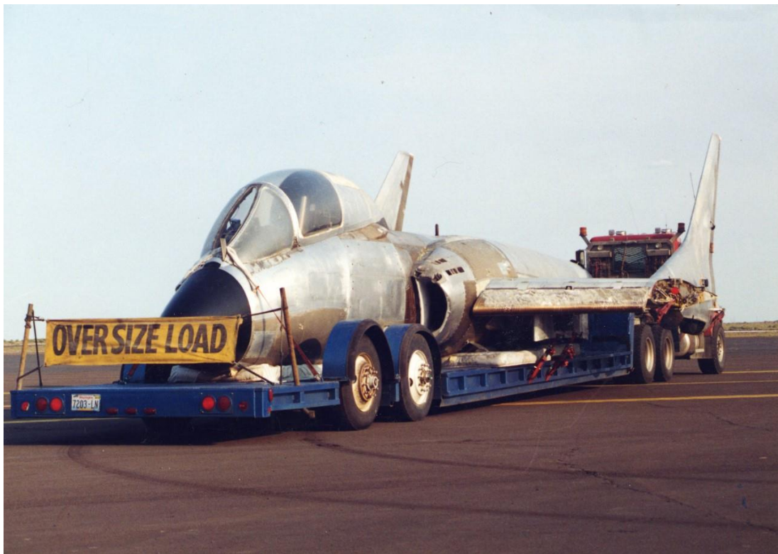
On the boat trailer to the Museum of Flight in Everett, WA