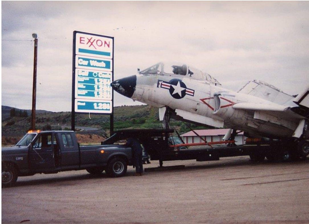
The first leg of the trip to Ephrata, WA