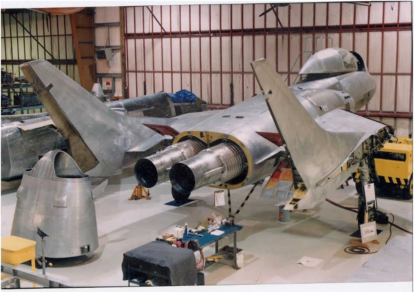
The Chance Vought F7u-3 Cutlass at its destination at the Museum of Flight in Everett, WA having the final restoration completed.