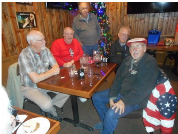
Now, there's a group!