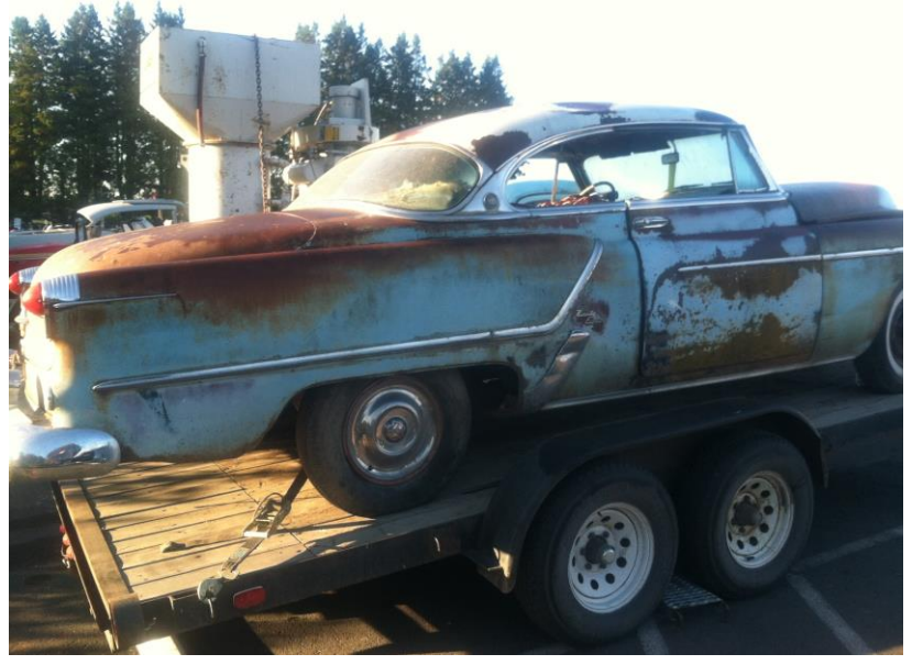
He said it would be an easy restoration!

1985 Oldsmobile Cutlass Supreme Brougham 5.0L V8 4BBL Coupe 2D 49,444 ORIGINAL miles runs great! Car has always been in the same family. Free AutoCheck Vehicle History Report Interested? Please email <u>oldsmobilecutlass85@gmail.com</u> Car located in Indianola, WA (1 )