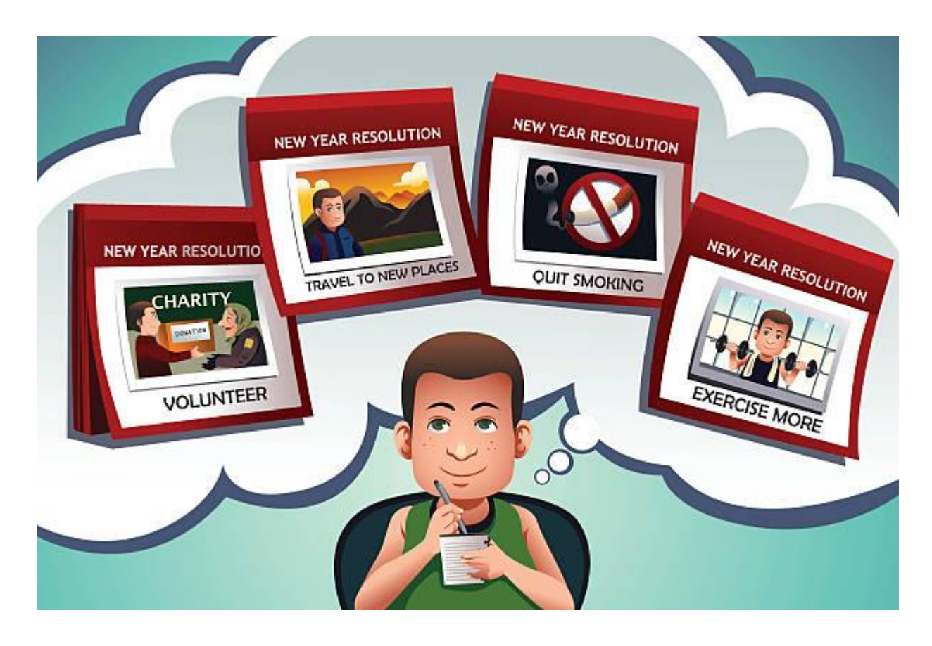
What is your resolution for the New Year?