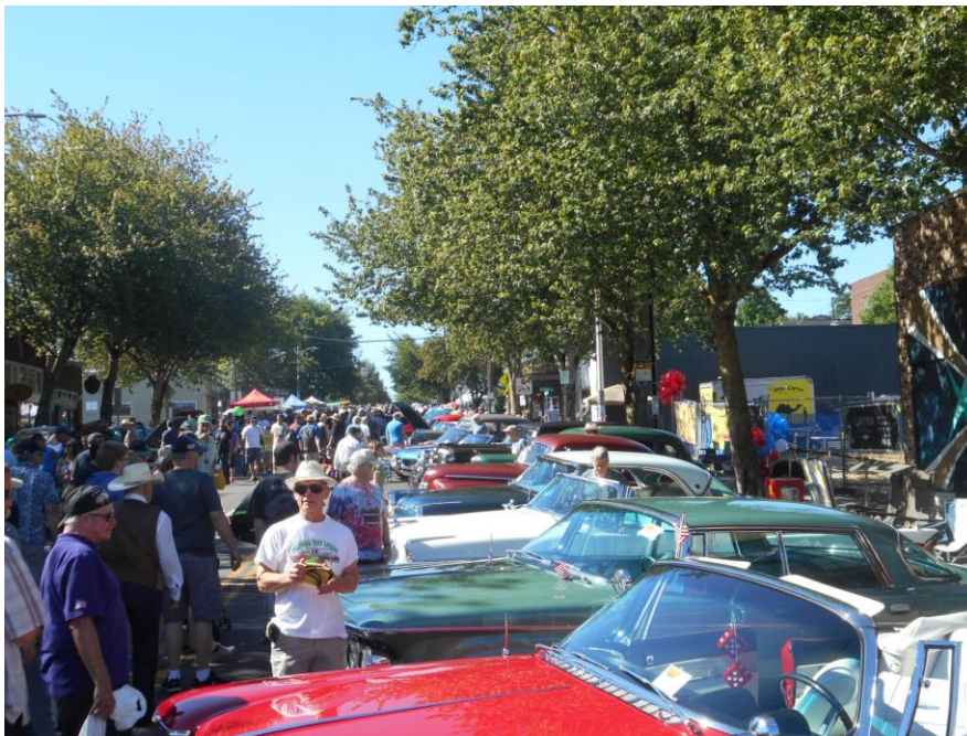
The 2017 Greenwood Car Show