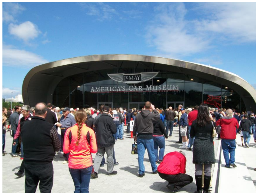
Grand opening of America's Car Museum - 2012