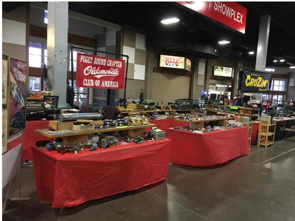
The set-up at the Puyallup Early Bird Swap Meet – Feb. 16

Hardware Sales Parking Lot, 2034 King St. Bellingham, WA 98225; 10am – 3pm; Adm. Free; Reg. Fee - $10; Vendors Free; 4 th Corner Elites Car Club; 360-380-2733; babsthekraut@yahoo.com ; http://fourthcornerelitescarclub.com