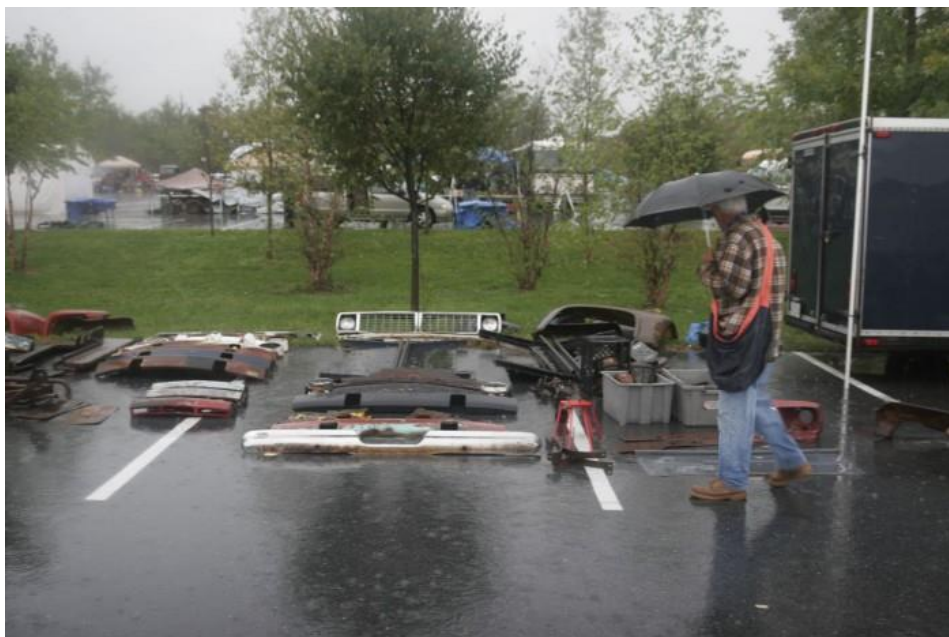
Checking out swap meet parts in the rain in Bremerton

CenturyLink Field Event Center, 800 Occidental Ave S, Seattle, WA 98134; 2pm – 9pm; noon – 9pm; 9am – 9pm; Adm. Fee - $16; WA State Auto Dealers Assn; 310-531-5984; info@seattlesutoshow.com