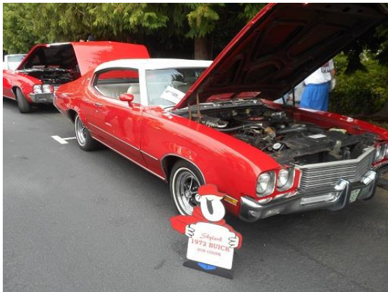
1972 Buick Skylark Sport