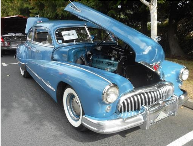
1948 Buick Super Sedanette