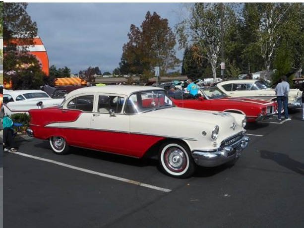
1955 Super 88 – 2 door post – rare car