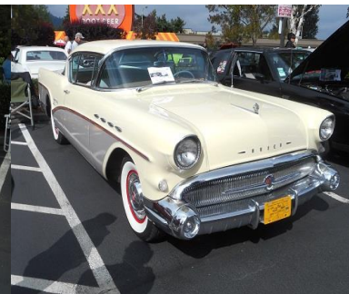
’57 Buick Roadmaster