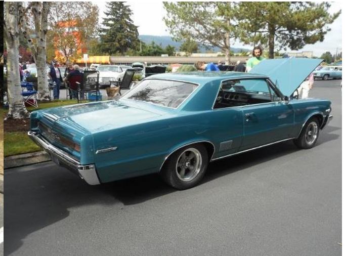
1964 Pontiac LeMans Hardtop