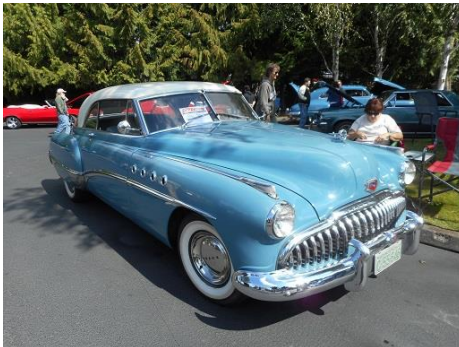
'49 Buick Roadmaster Riviera