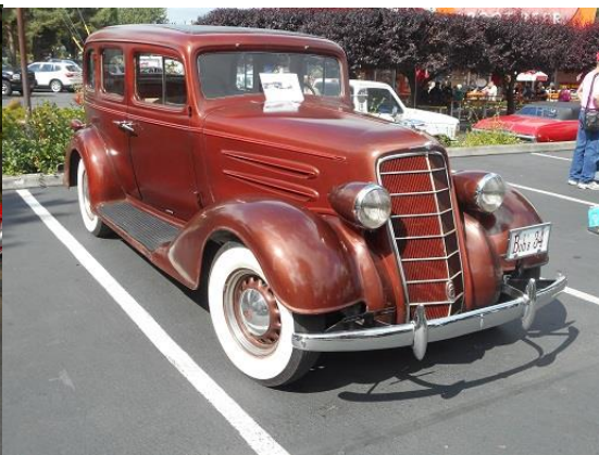
1934 Olds Sedan