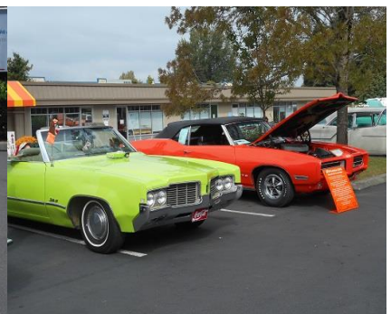
A colorful Olds and Pontiac