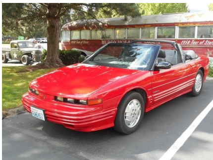
’92 Cutlass Convertible