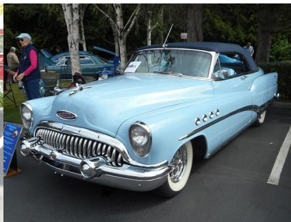
’53 Buick Convertible