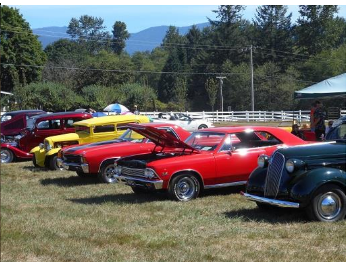
A line up of street rods