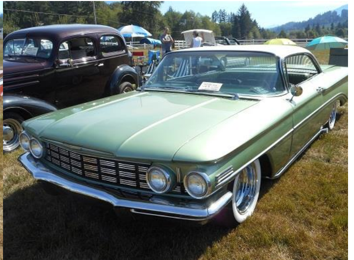
The Rogers' '60-68