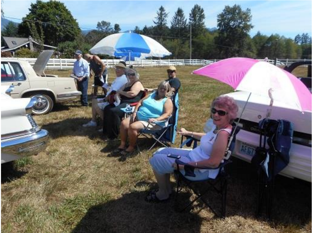
Chapter members at the Rhodes River Ranch Car Show....relaxing!