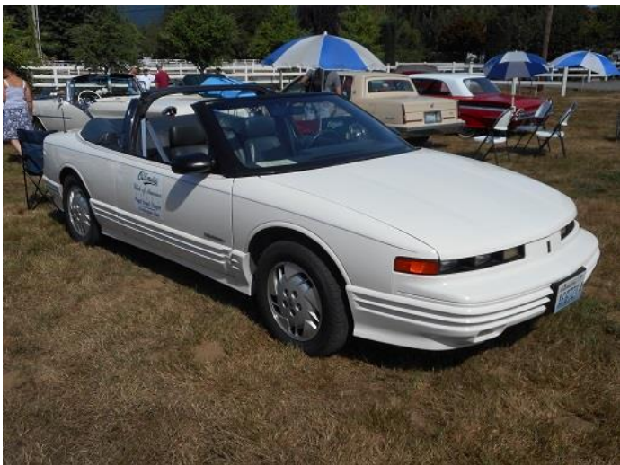
Pam's '92 Cutlass Supreme Convert.