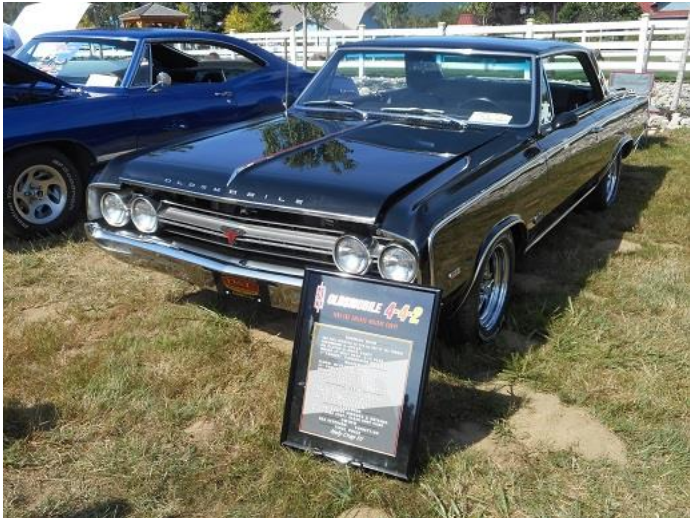
Ned Peterson's '64 442