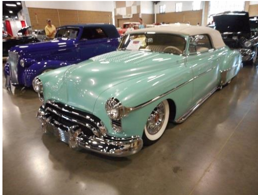
Gorgeous custom '50 Convertible