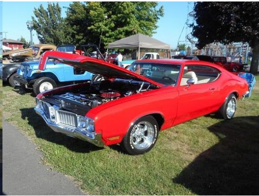
'70 442 without stripes