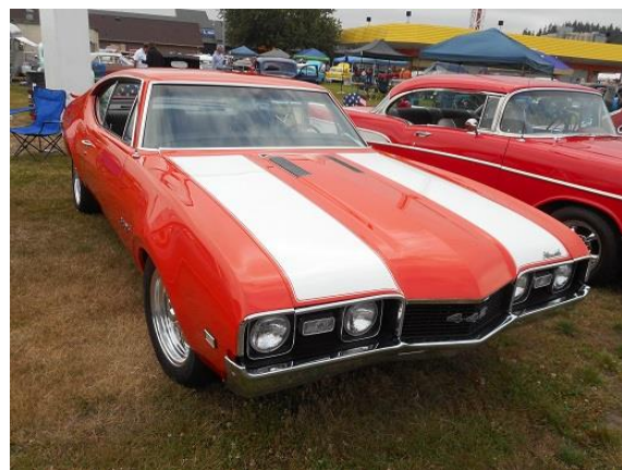
Nice '68 442