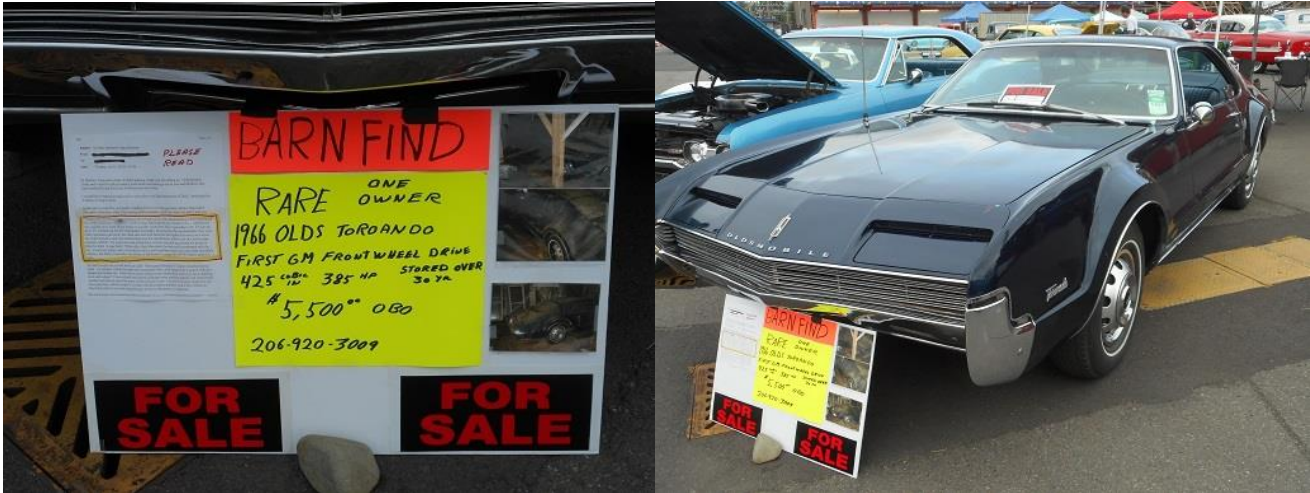
Here was an opportunity to start your restoration or drive it as you found it.