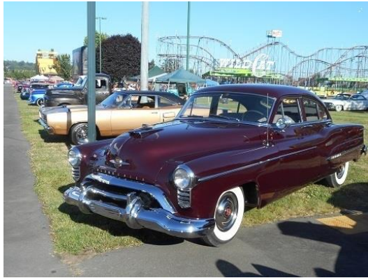
Your Editor's '50 98 Town Sedan