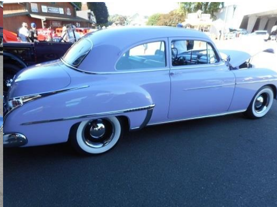
Very nice '50 88 Coupe