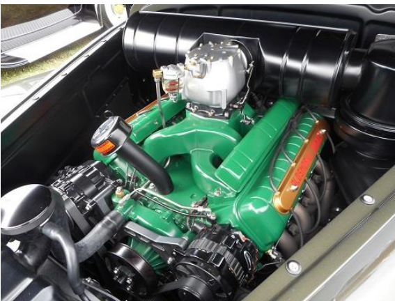
The LS1 injected engine in the '40 Olds