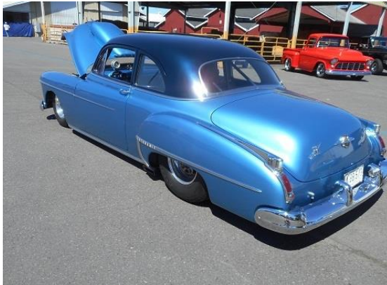
1950 88 Pro-Street