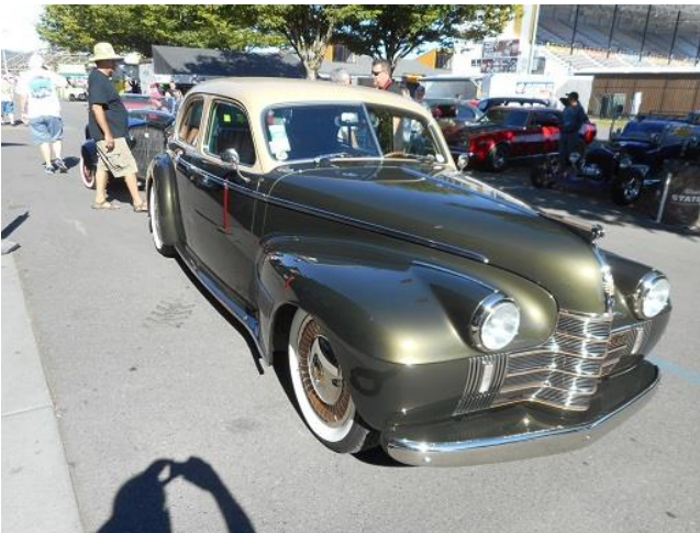
Beautiful '40 Olds from South Dakota