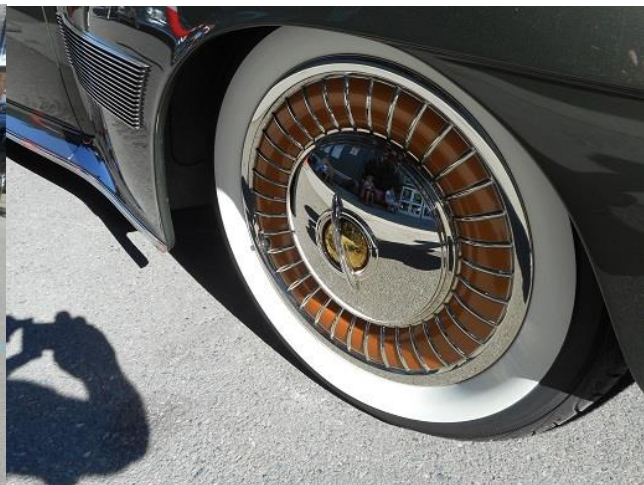
This is not a hub cap but a machined wheel.