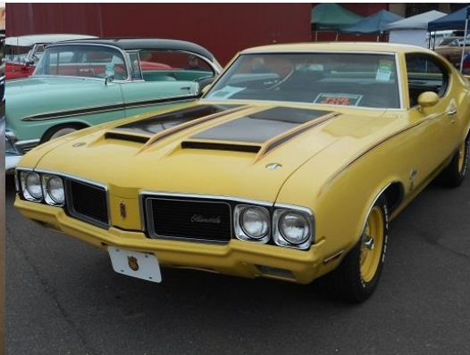
Dave Lawrence's Rallye 350