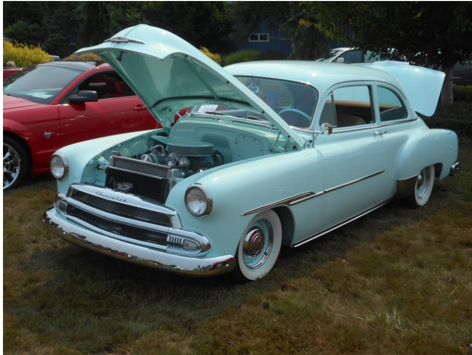
Ned Peterson’s 1950 Chev - Favorite 1950-54