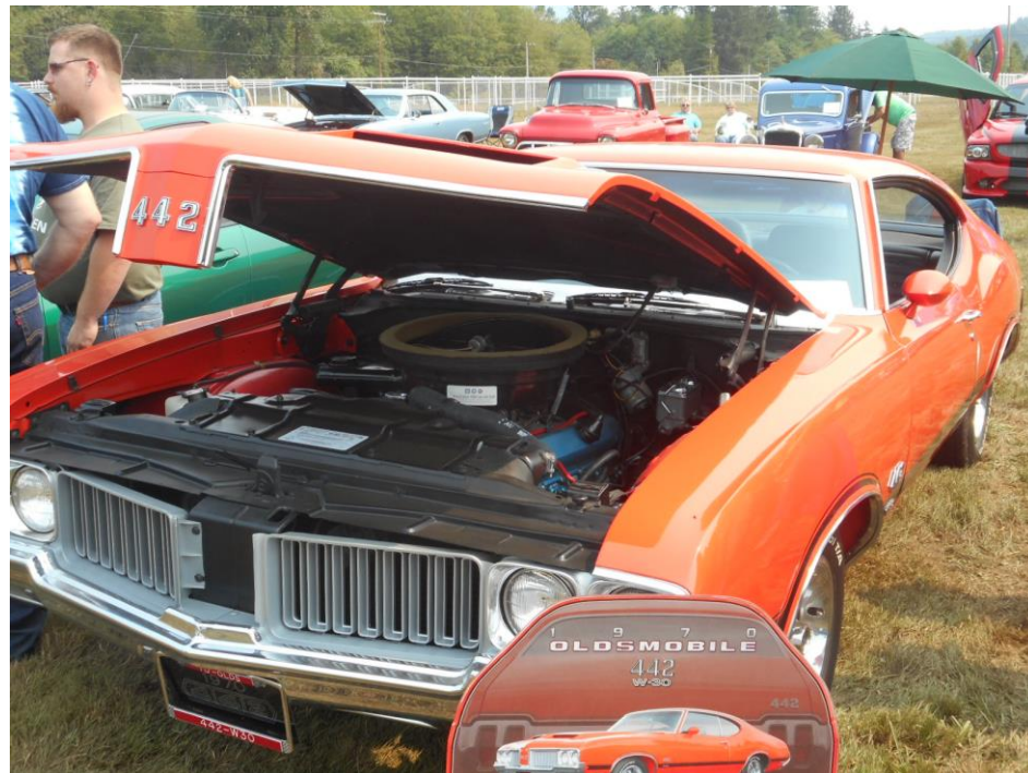
Charles Wascher’s 1970 442 W30 – Favorite 1970-79