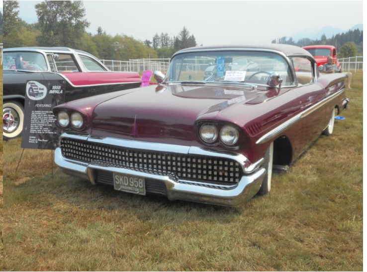
Pam and Derald Owens '58 Impala