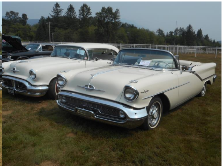
Bill Snyder's '56 and the Straw's '57 Convertible