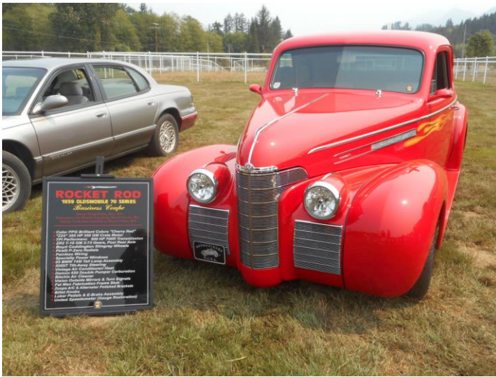
Greg "Rocket" Hinton's '39 Hot Rod