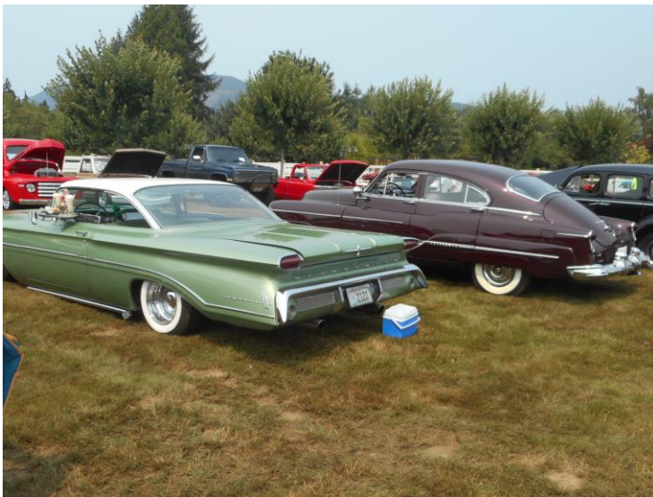
The Roger's '60 Olds with Ed and Pam's '50 Town Sedan