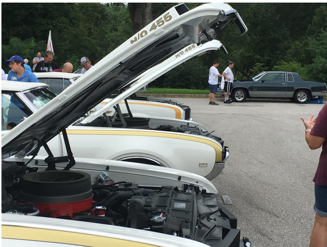
The open hoods in a row of 1969 Hurst Olds