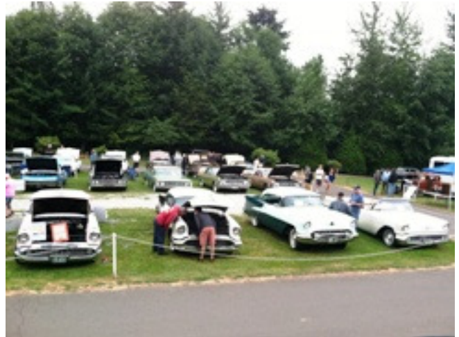
A view of the show field