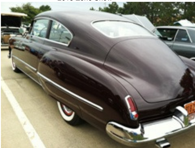
2013 Olds Nationals