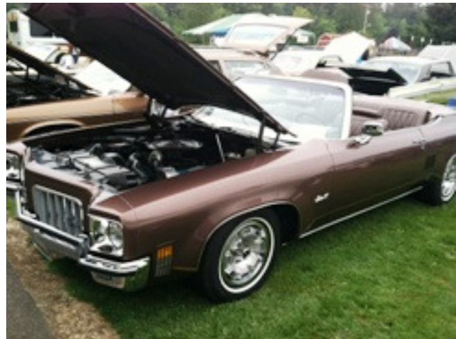
2013 Zone Show