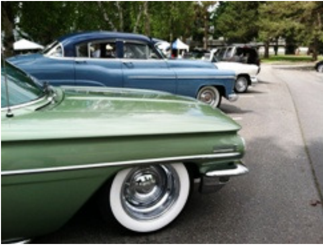
2013 Ford Picnic