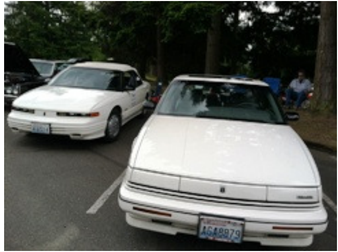
2013 Ford Picnic