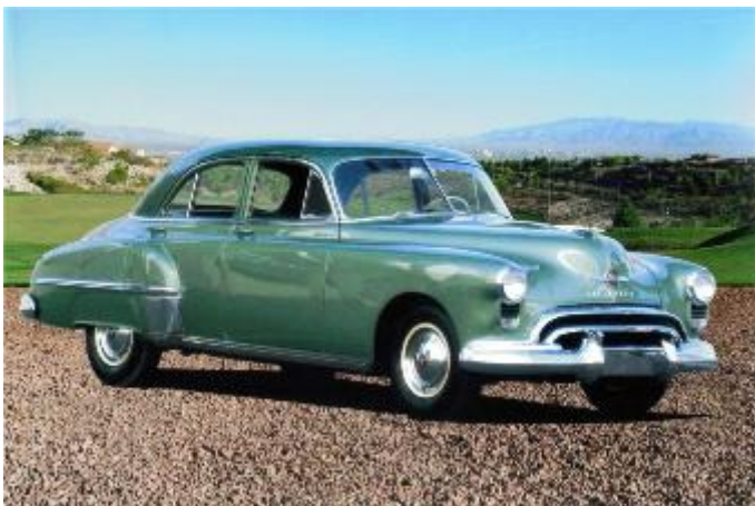
1949 Model 76 sold for $29,700 – from GM Collection Puget Sound Oldsmobile Club – February 2013