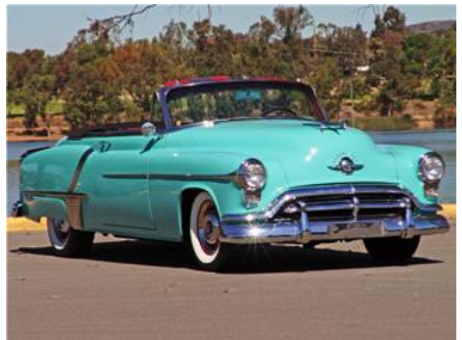
1952 88 Convertible sold for $52,800