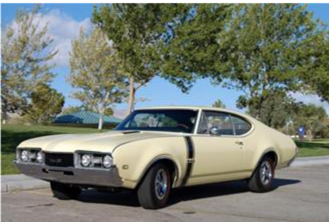
1968 442 sold for $52,800 – Thornton restoration