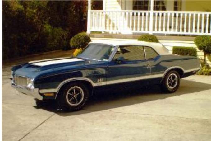
1970 W30 sold for $137,500 – 1 of 96 - 4 speed cars