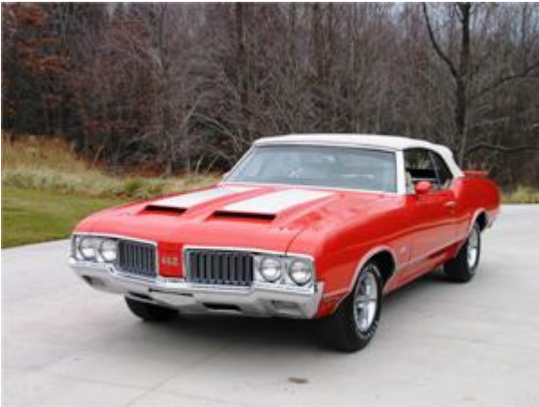
1970 442 sold for $88,500