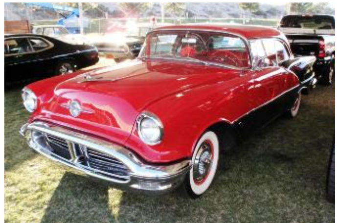
1956 Holiday 88 sold for $18,700