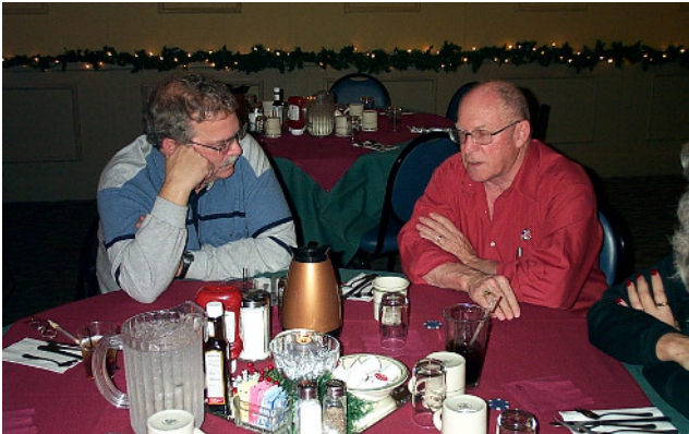
Now this is how you listen intently!