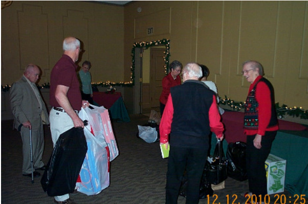
Members loading the “Toys for Tots” gifts.