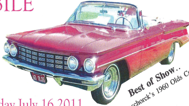
Best of Show .. Larry Genschorck's 1960 Olds Convertible