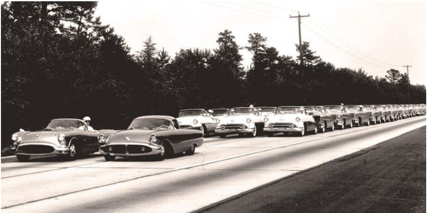
Cutlass Convertible and Coupe leading a group of 1955 Starfires