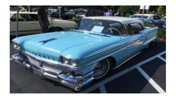
Saturday July 10, 2021