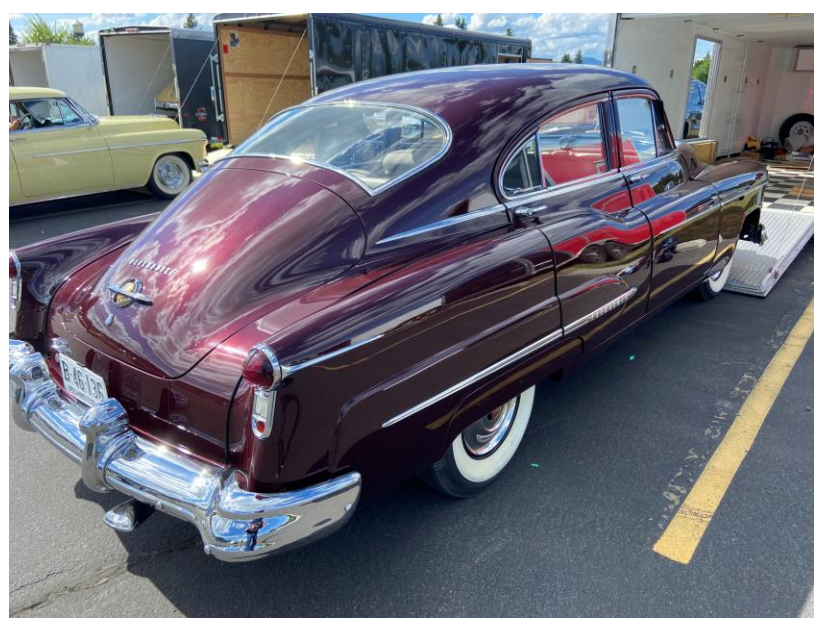
Your editor's 1950 Town Sedan "Best of Class" loading for home.