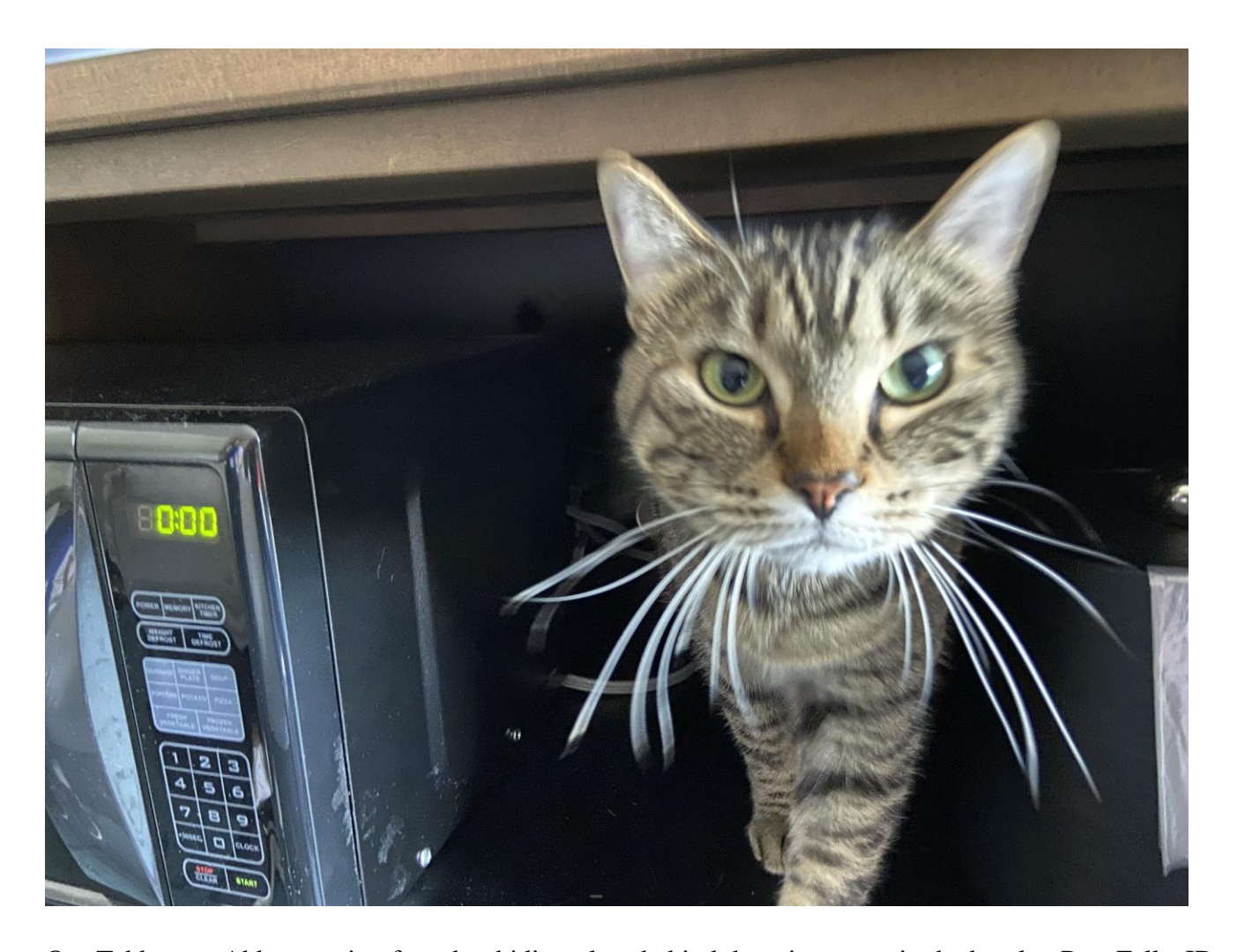
Our Tabby cat, Abby, coming from her hiding place behind the microwave in the hotel at Post Falls, ID