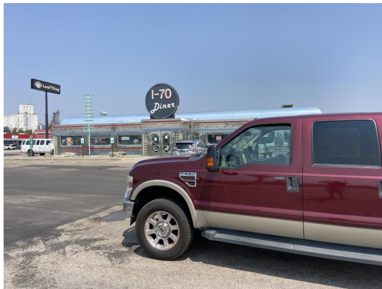
This diner was found in North Dakota dis-assembled in six sections. Trucked to Colorado and rebuilt on I-70. It is a replica of diners in the 50's.