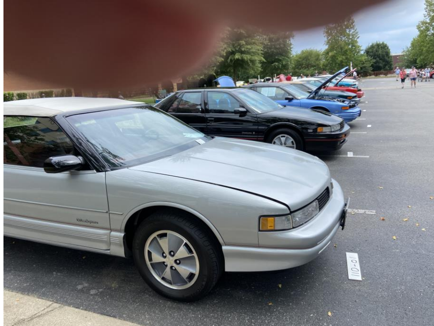
Our 1991 Cutlass Supreme Convertible at Nationals – Including thumb print!