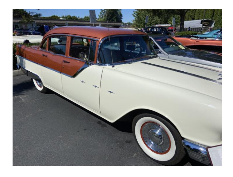
1955 Pontiac Starchief Sedan