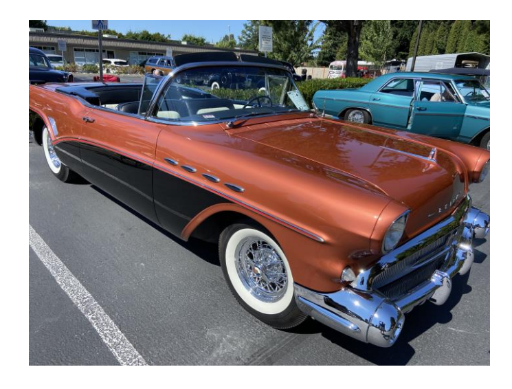
1957 Buick Roadmaster Convertible