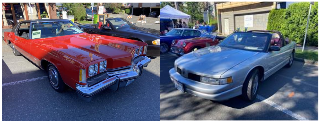
Nice '73 Toro