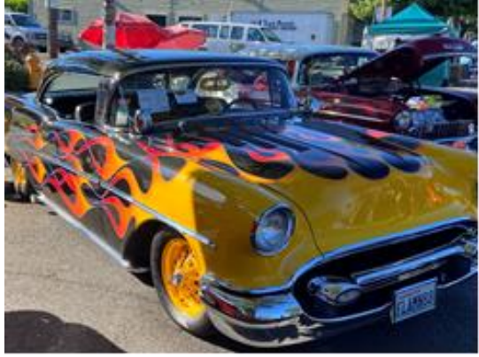
The Flamin' 88