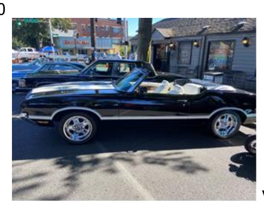
Very nice '72 Cutlass Conv.