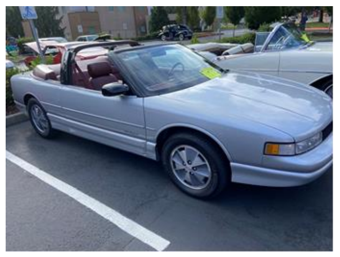
Your Editors '91 Cutlass Supreme Convertible (Photo from the BOP Show)