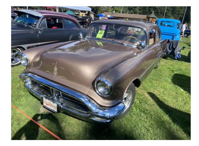
This '56 has a great stance!