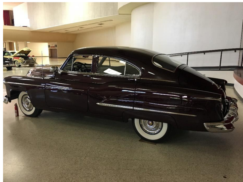
Your editor's 1950 98 Town Sedan

Photos from the 2019 Nationals in Wichita