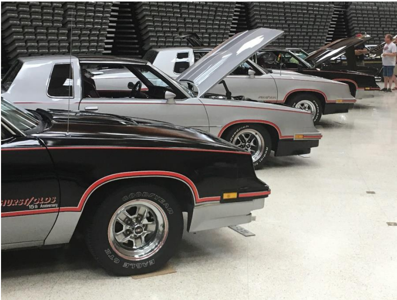
Hurst Olds in the indoor display