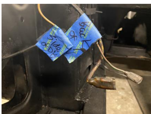
Tape flags work perfect for keeping track of wires