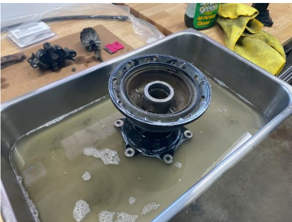
A mixture of soap and water

While tedious and oft annoying, cleaning your project will make for a much more satisfying assembly. Take the time to make every project something worth showing off and being proud of and it will elevate your DIY confidence far more than you might realize.