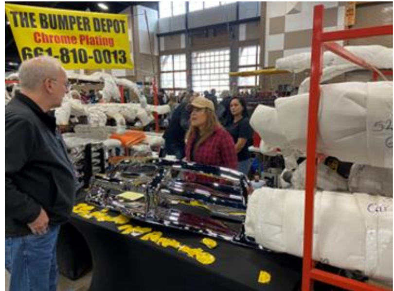
One of the chrome vendors