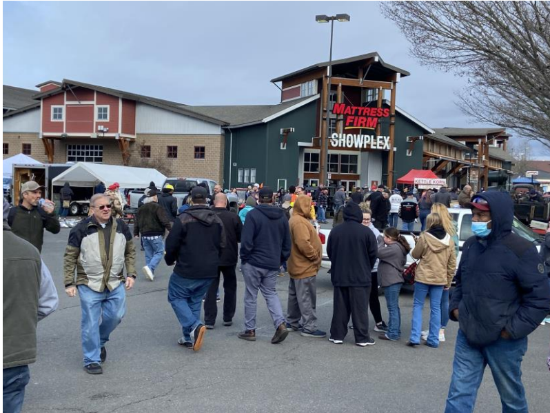
Showplex at the Fairgrounds

The Last “Almost Spring Swap Meet” took place on Feb. 18-19 at the Washington State Fairgrounds. The Model T Club has decided not to continue with the swap meet in 2024. Their show will be missed.