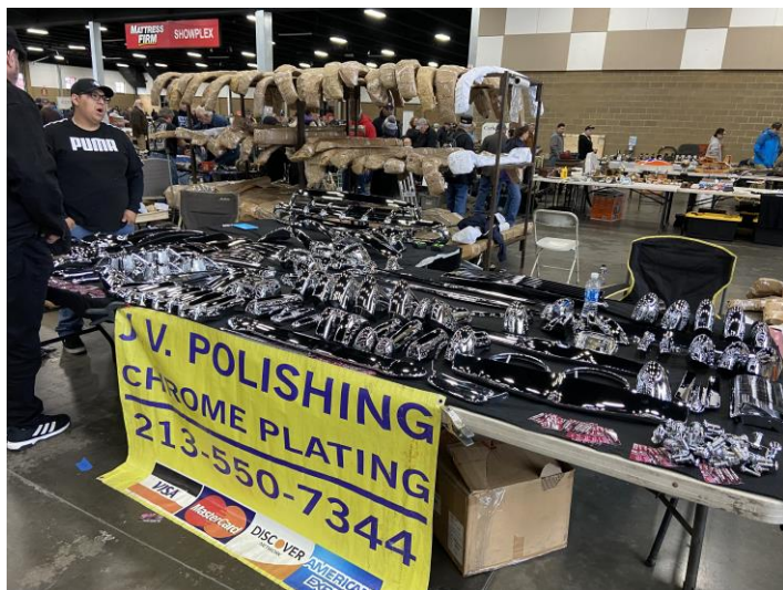
Another chrome vendor