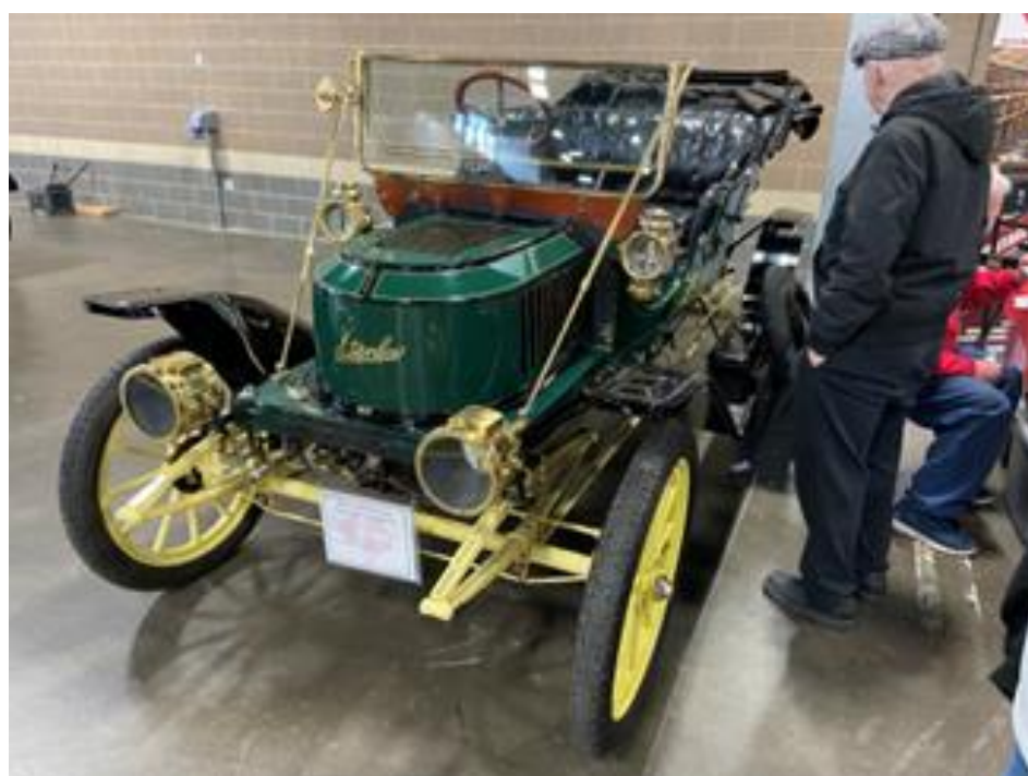
1909 Stanley Steamer on display for LeMay's Marymount Museum