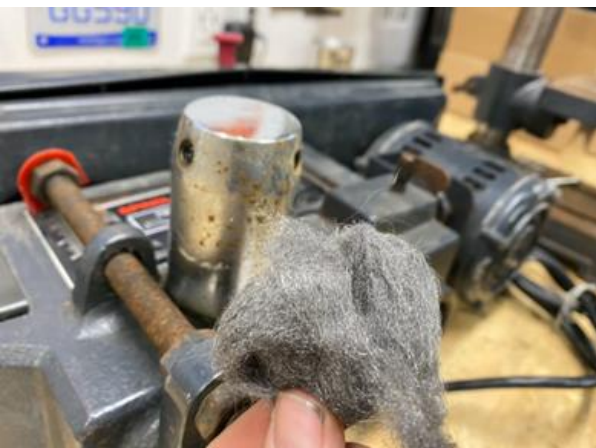
Steel wool works great