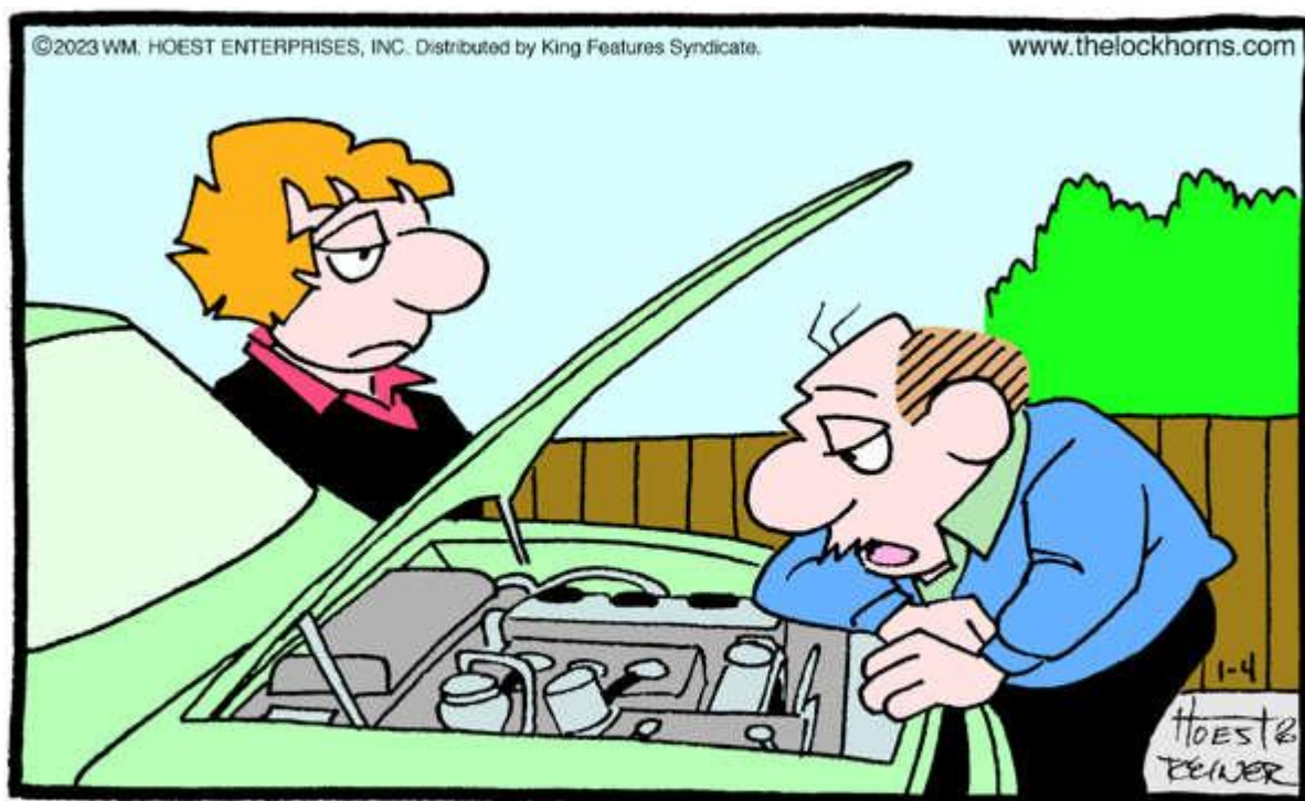
"I DON'T KNOW WHAT I'M LOOKING FOR ... I DON'T EVEN KNOW WHAT I'M LOOKING AT."