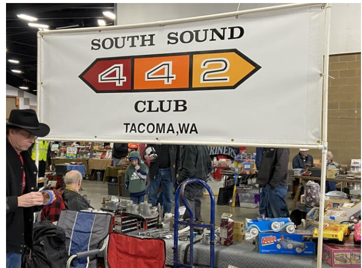
Our local 442 chapter