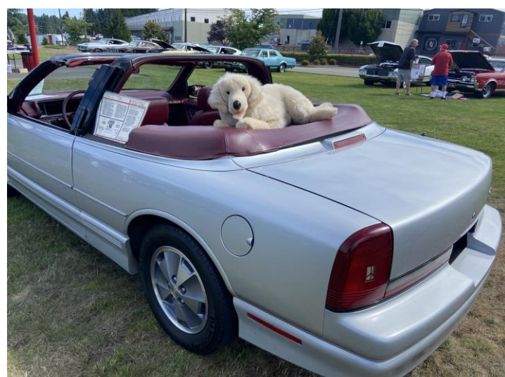
Ed and Pam's 1991 Cutlass with dog