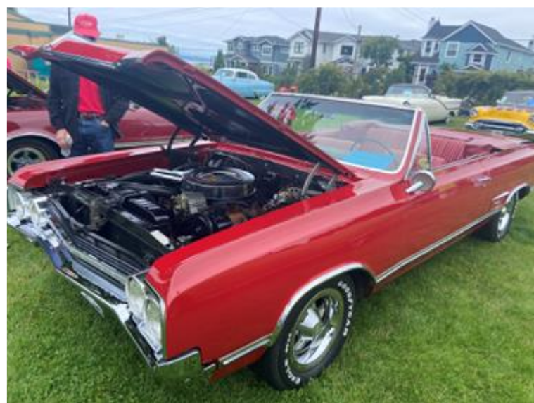
Dave Lawrence's 1965 442 Convertible