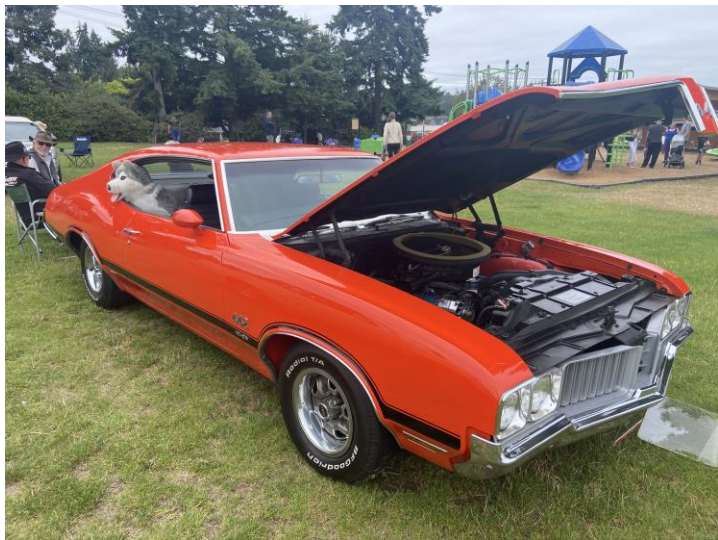
Charles Wascher's 1970 W30