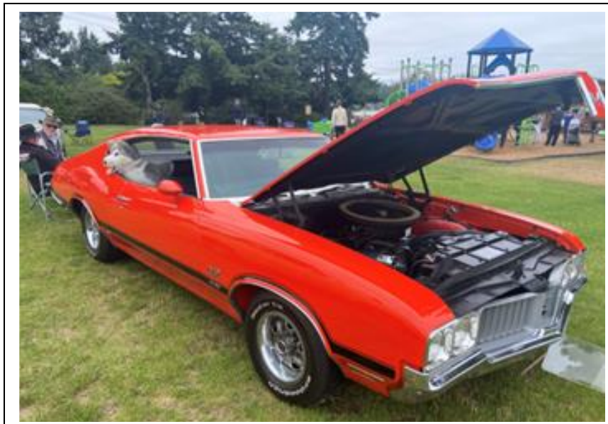
Charles Wascher's 1970 W30 – Best of Show