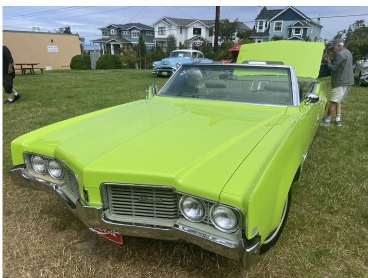
Bob Campbell's 1969 98 Convertible