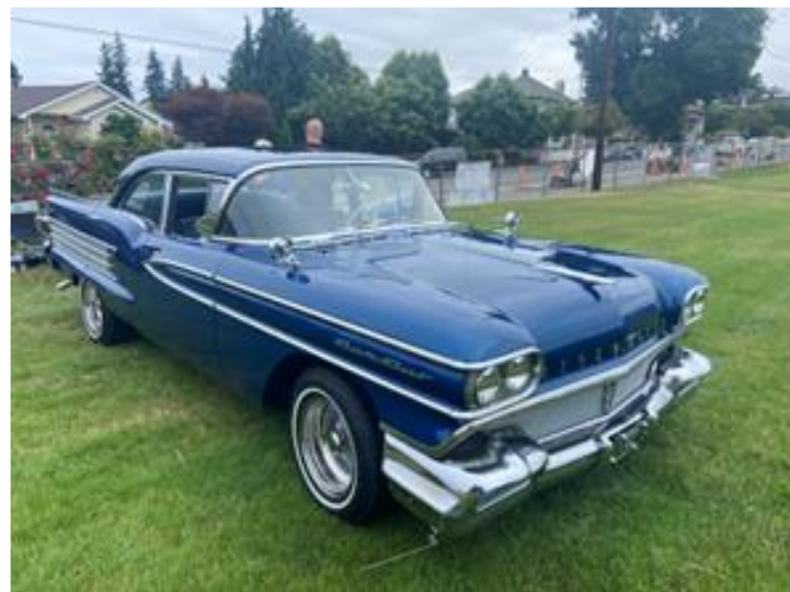
Beau Stone's 1958 4 Door Sedan