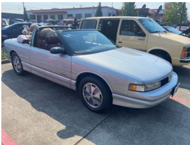
Our 1991 Cutlass Supreme Conv.

So, we signed up online for the show and lined up at 8:30am on Saturday. Wow, we had never been to a show with over 400 cars registered. We were about to leave the show at 1pm and discovered a sticker on the windshield of our Olds, " Stick around you have been selected for an award ". When the awards were passed out, we were called to the stage and received one of the eleven awards. Below are photos of the show.