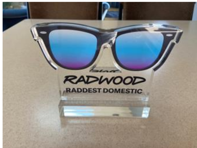
Our award for the "Baddest Domestic"