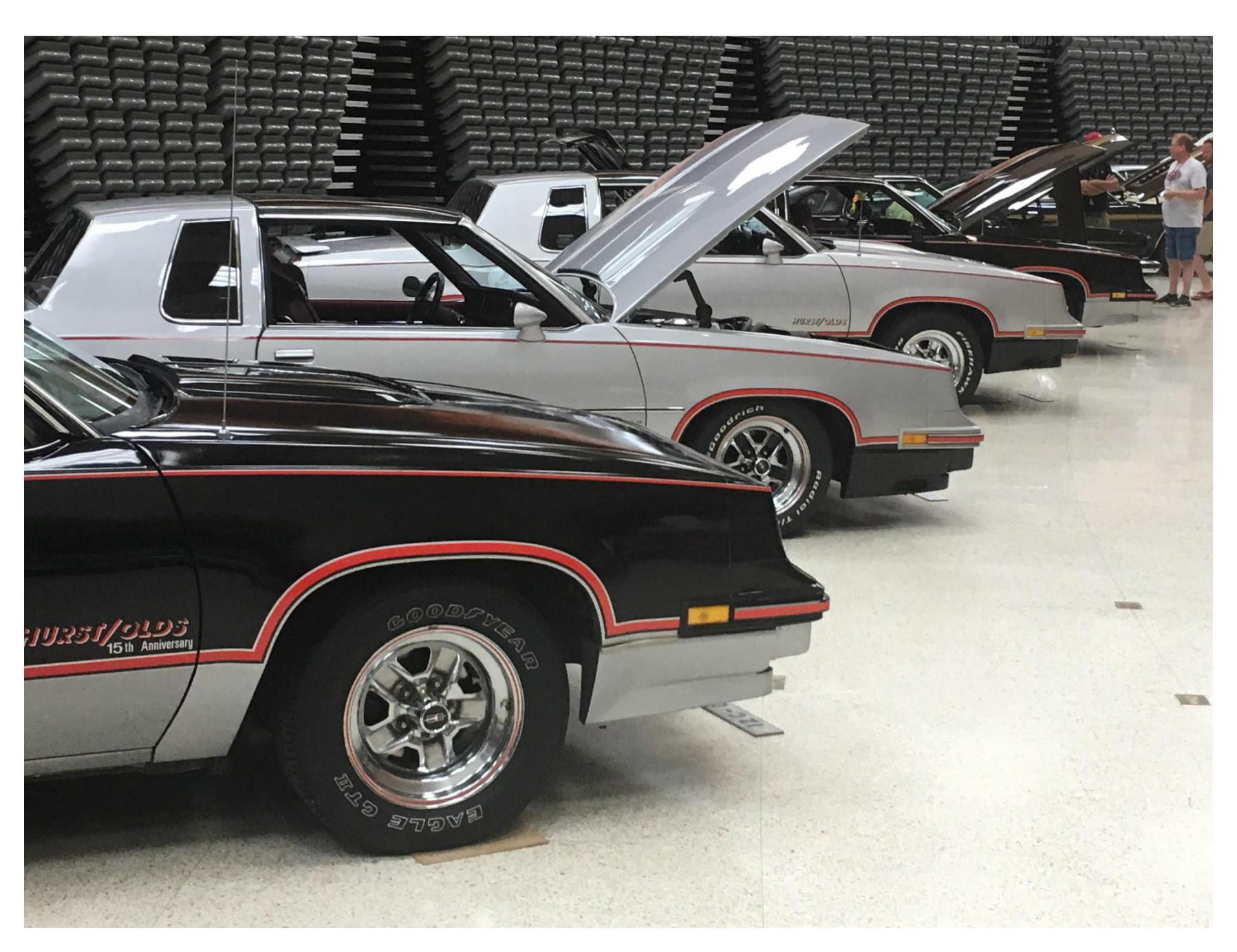
A row of Hurst Olds pictured at the 2019 Nationals in Wichita