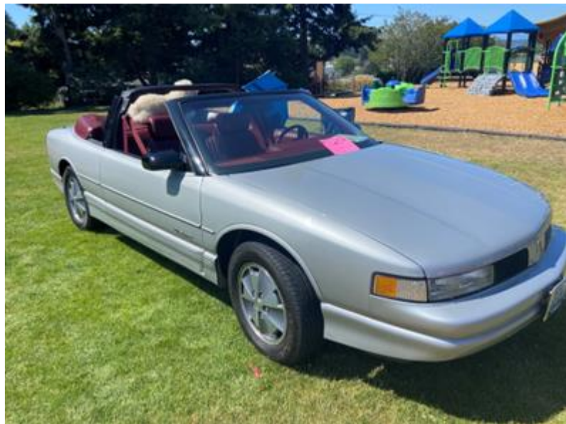
Best of the 80's and newer - Ed Konsmo - 1991 Cutlass