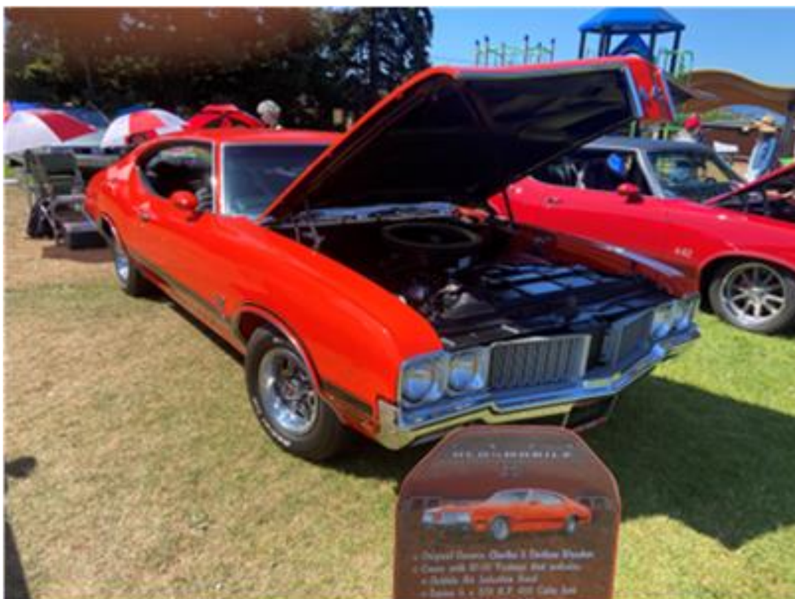
Best of Show - Ray Angel - 1970 442