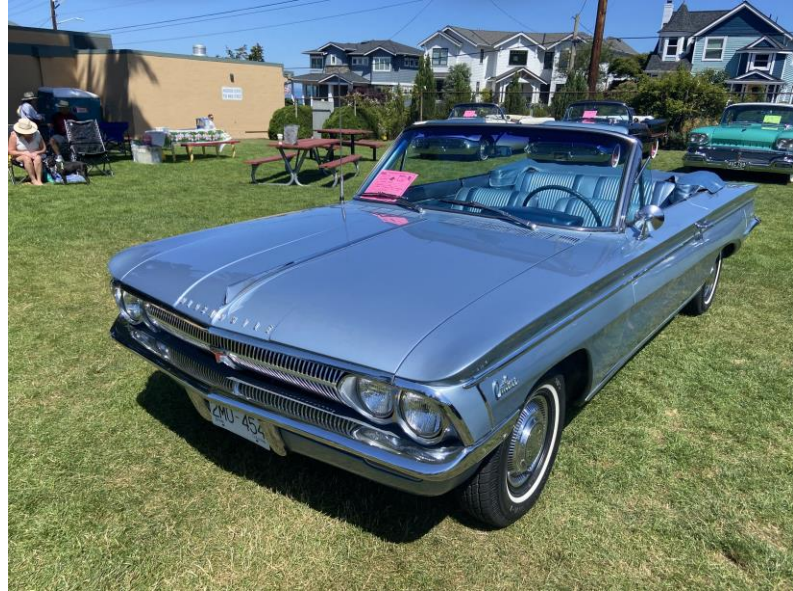
Best of the 60's - Gord Lloyd - 1962 F88 Conv.