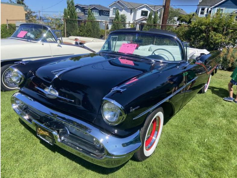
Best of the 50's - Larry Moore - 1957 Super 88 Conv.

Since there are no car shows this month, we are showing the Zone Show again.